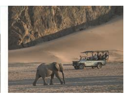
27 Aug (Sat) DAMARALAND/HOBATERE – WESTERN ETOSHA Early breakfast and then depart with your guide on an exciting 4-wheel excursion along the Aba Huab and

Huab River valleys searching for desert adapted elephant.